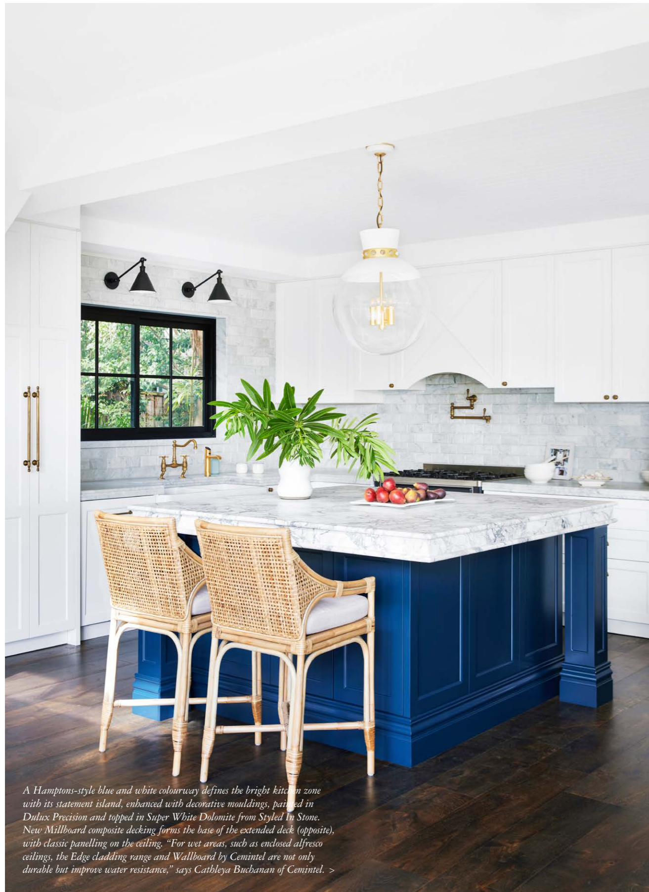
A Hamptons-style blue and white colourway defines the bright kitchen zone with its statement island, enhanced with decorative mouldings, painted in Dulux Precision and topped in Super White Dolomite from Styled In Stone. New Millboard composite decking forms the base of the extended deck (opposite), with classic panelling on the ceiling. "For wet areas, such as enclosed alfresco ceilings, the Edge cladding range and Wallboard by Cemintel are not only durable but improve water resistance," says Cathleya Buchanan of Cemintel. >